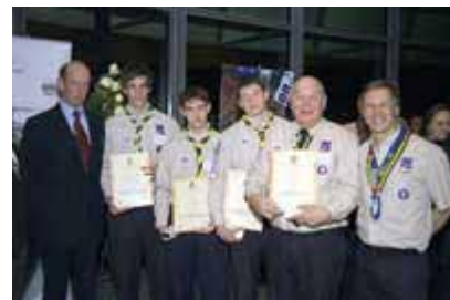
Some members of Southgate District who received the Gallantry awards