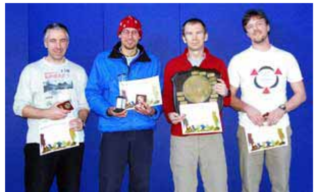
Team 8 - The Late Finishers Winners of the 50 Miles